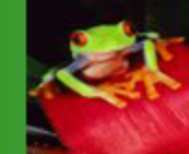
Reggie, Tree Hugger